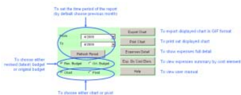
Figure 3: Explanations of other controls on the GUI.