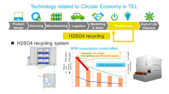
[Figure 4] Technologies leading to a circular economy