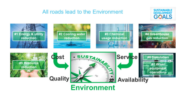
[Figure 7] All roads leads to the Environment