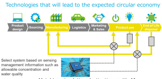
Matching circulation destinations with AI