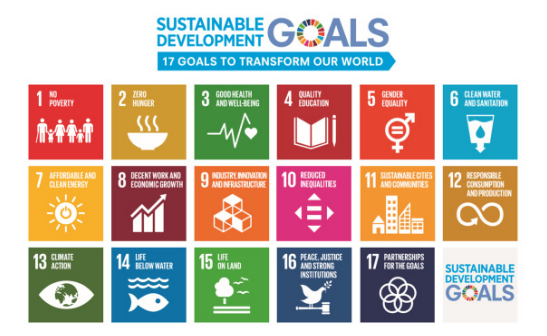
[Figure 1] 17 Sustainable Development Goals